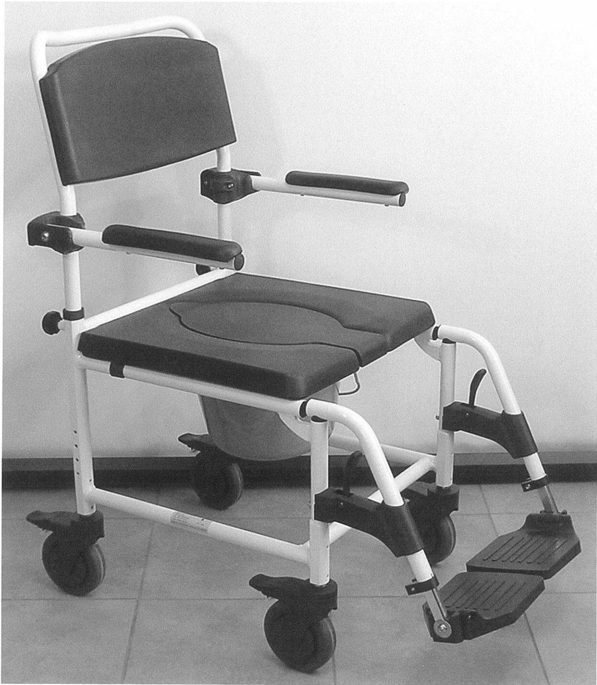
PHOTO OF PRODUCT